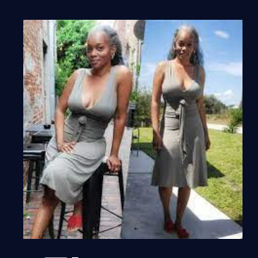
Elevate Your Style

Find confidenceboosting outfit ideas that are sure to leave a lasting impression on your date.