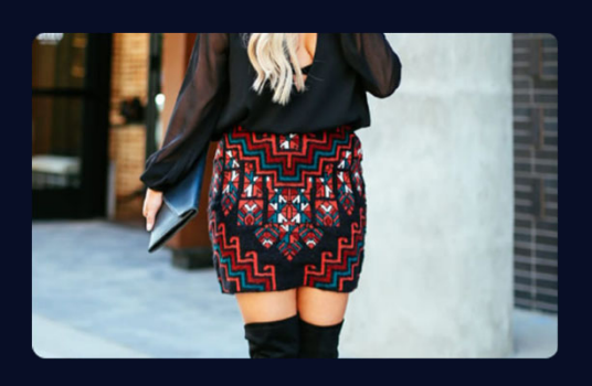
Showcase Your Personality

Strike the perfect balance between comfort and style, creating a relaxed yet trendy look.