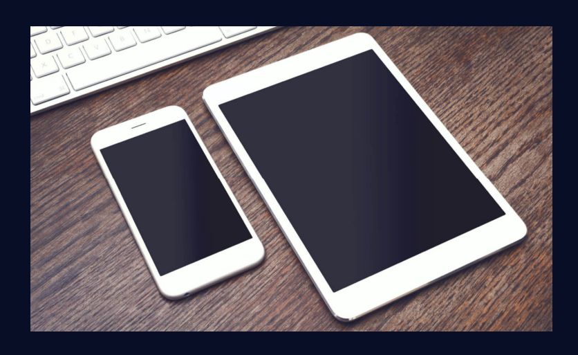
Let's Talk Tech

Discover the advantages for the 50+ generation. Take control of your dating life and feel empowered.